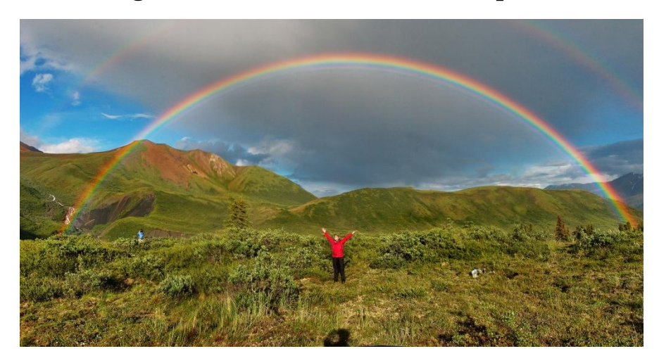
Somewhere over the rainbow, Skies are blue. And the dreams that you dare to dream really do come true...

~ Believing in Yourself & Your Divine Purpose NOW ~